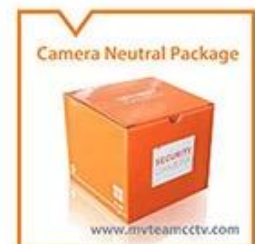
Camera Neutral Package