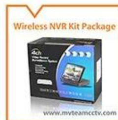
Wireless NVR Kit Package