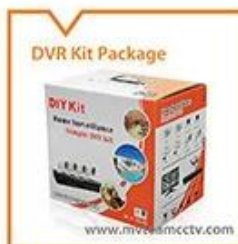
DVR Kit Package