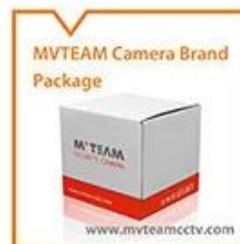
MVTEAM Camera Brand Package