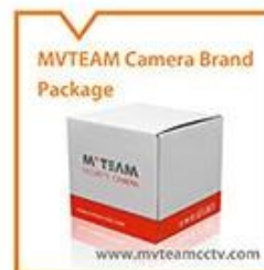
MVTEAM Camera Brand Package