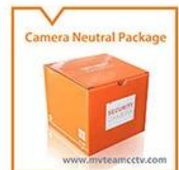
Camera Neutral Package