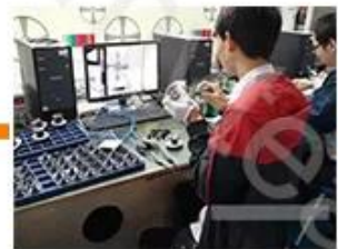
Camera Test 1