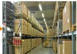
Ready for shipping