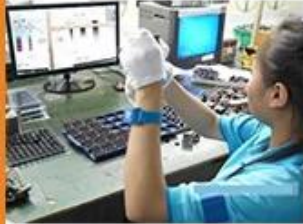
Camera Test 2