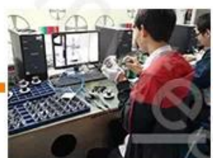
Camera Test 1