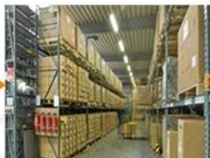
Ready for shipping