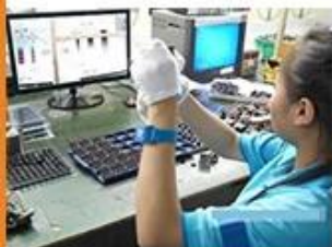
Camera Test 2