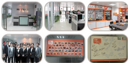
office and showroom

Shenzhen MVTEAM Technology Co, Ltd is a factory of Security Products since 2003.