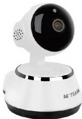
WiFi Smart Camera