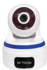
WiFi Camera with RJ45 port