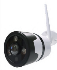
Waterproof WiFi Camera