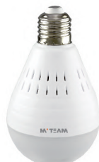
Light Bulb VR Camera