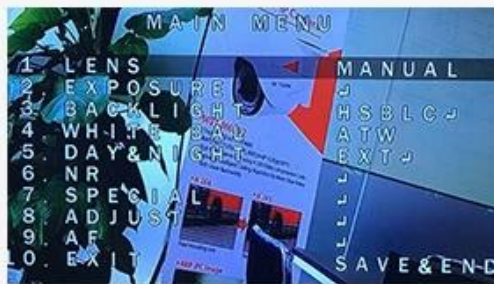
Call OSD menu