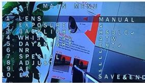
Call OSD menu