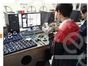
Camera Test 1