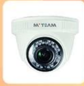
MVT-D28 6mm lens, 36pcs×Φ5 IR leds