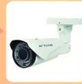
MVT-R62 2.8-12mm vari-focal Lens, 42pcs×Φ5 IR leds