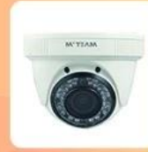
MVT-D29 2.8-12mm vari-focal Lens, 36pcs×Φ5 IR leds