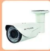
MVT-R21 2.8-12mm vari-focal Lens, 42pcs×Φ5 IR leds