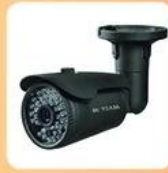
MVT-R30 8mm Lens, 42pcs×Φ5 IR leds