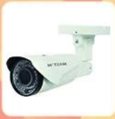
MVT-R46 8mm(CS) Lens, 42 pcs IR leds