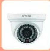
MVT-D22 6mm lens, 36pcs×Φ5 IR leds