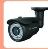
MVT-R58 9-22mm vari-focal Lens, 72pcs×Φ5 IR leds