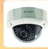
MVT-D26 2.8-12mm(M12) vari-focal Lens