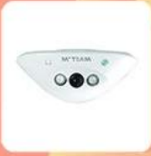
MVT-D30 6mm lens, 24pcs×Φ5 IR leds