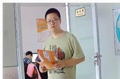
AHD Camera+AHD DVR