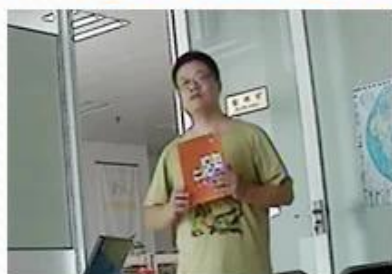
Analog Camera+Analog DVR