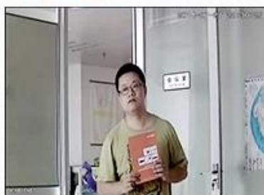
AHD Camera+Analog DVR