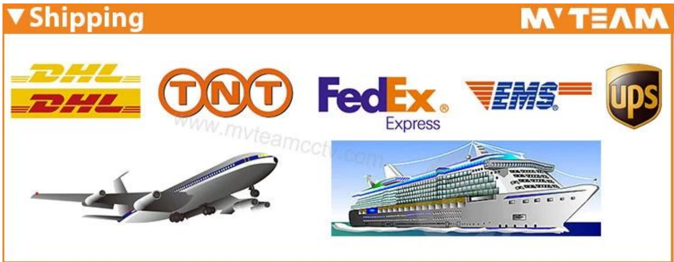
Shipping: Based on the your demands to choose the best shipping way.