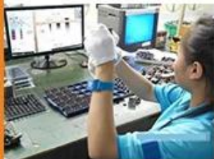
Camera Test 2