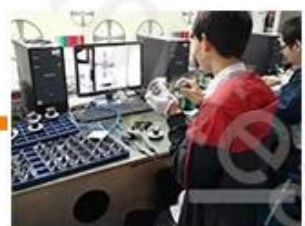
Camera Test 1