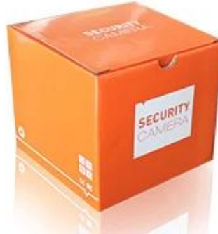
Neutral Camera Package