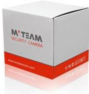
Brand Camera Package