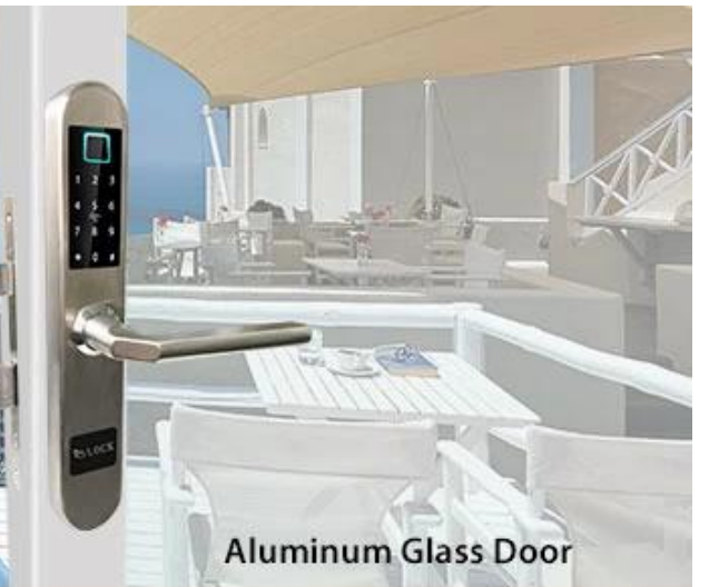
Aluminum Glass Door