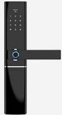
Bluetooth Door Lock

Please note the gateway device is only fit for MVTEAM smart door locks with APP, and the cost is not included in the smart lock price. If you need it, please tell us when purchasing smart door locks, we will add it into your order.