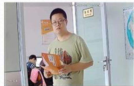
AHD Camera+AHD DVR