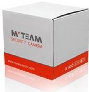
Brand Camera Package