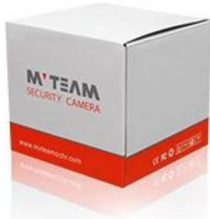
Brand Camera Package