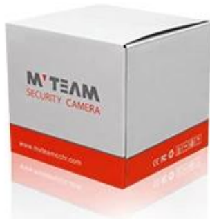
Brand Camera Package