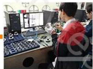
Camera Test 1