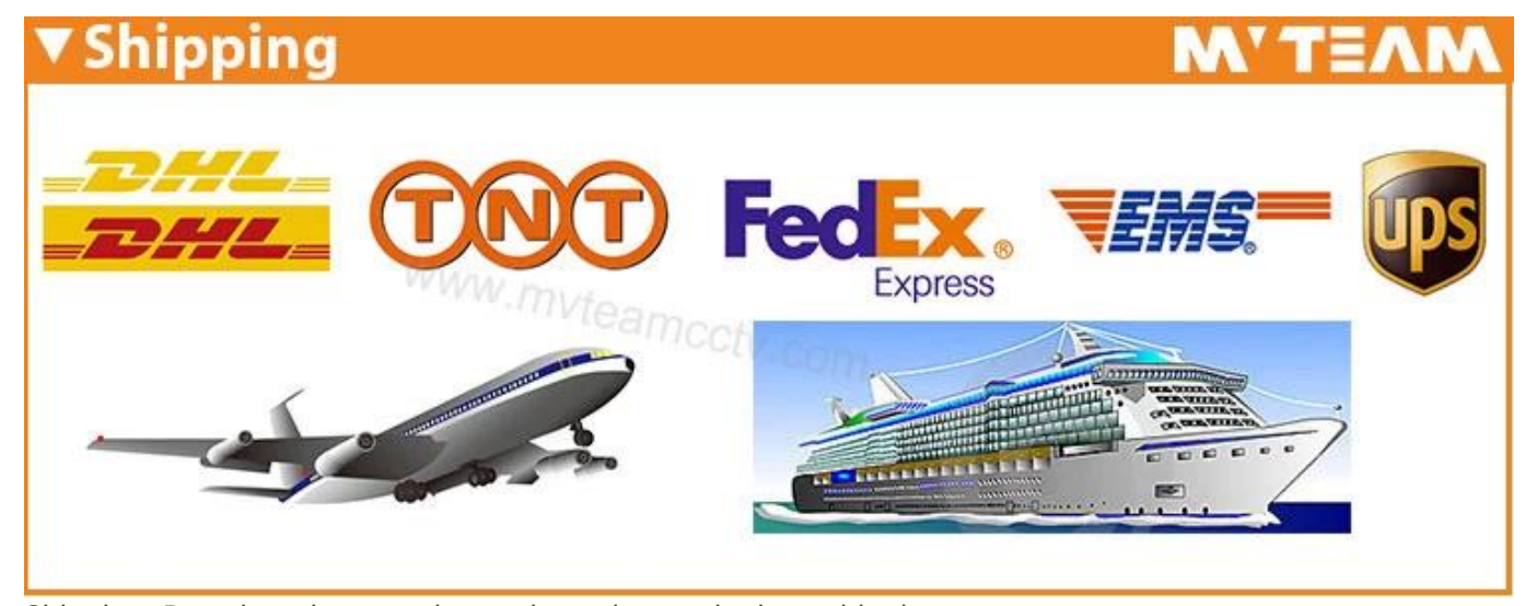
Shipping: Based on the your demands to choose the best shipping way.