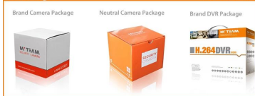
Package: M'TEAM Brand Box Or Neutral Box Or Specified by customer.