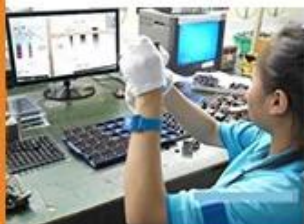
Camera Test 2