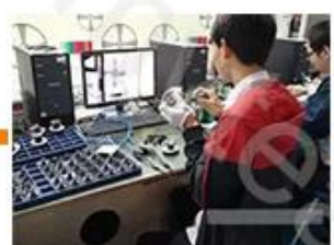
Camera Test 1