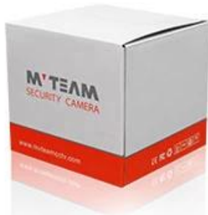
Brand Camera Package