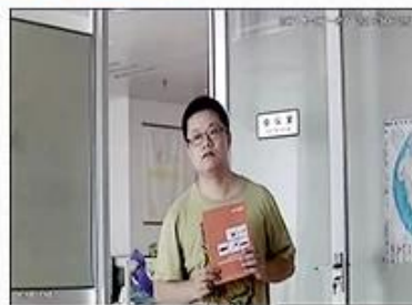
AHD Camera+Analog DVR