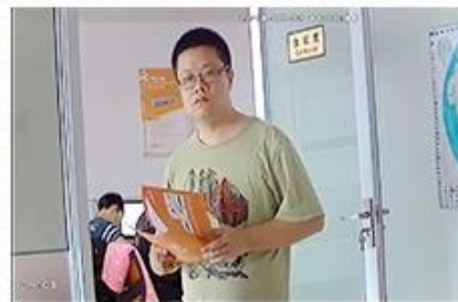
AHD Camera+AHD DVR