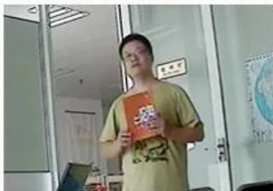
Analog Camera+Analog DVR