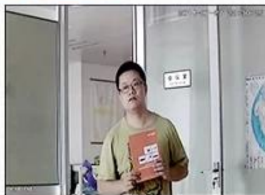
AHD Camera+Analog DVR