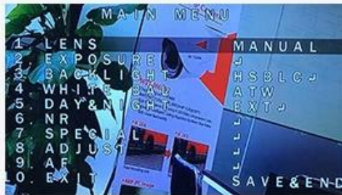
Call OSD menu