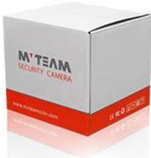
Brand Camera Package