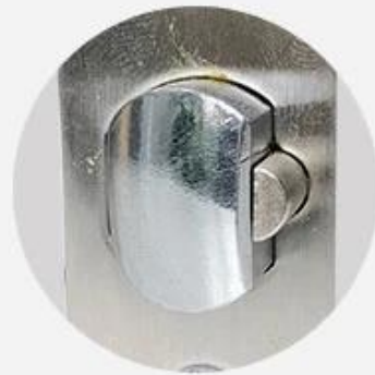
Optional 60mm~70mm Adjustable Single Latch F