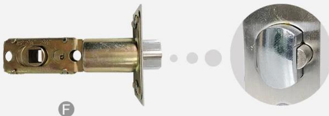
Optional 60mm~70mm Adjustable Single Latch F