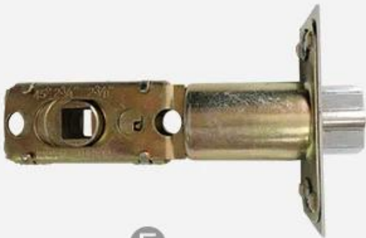
Standard 60mm Single Latch E with Anti-prying Tongue