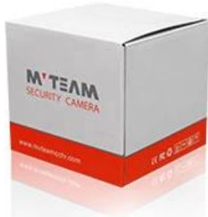
Brand Camera Package