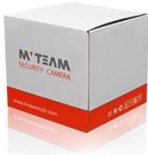
Brand Camera Package