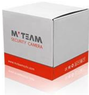
Brand Camera Package