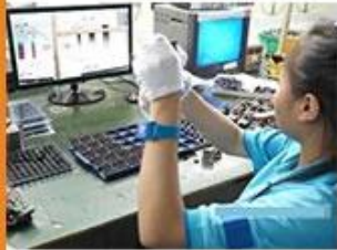
Camera Test 2