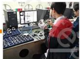
Camera Test 1