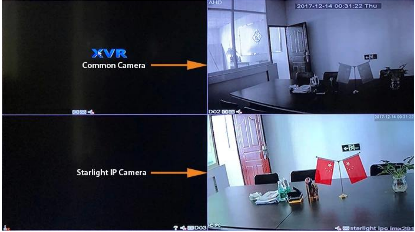
If you want to view the real image quality of starlight ip camera, please check below video record. Warmly notice: please do setup the player image quality to 1080p when watch the video.

Starlight IP camera VS Common Camera in low light environment.