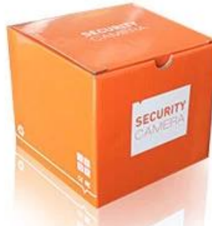
Neutral Camera Package