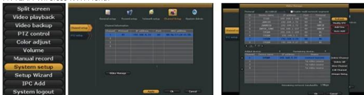
MVTEAM Wireless NVR Menu: