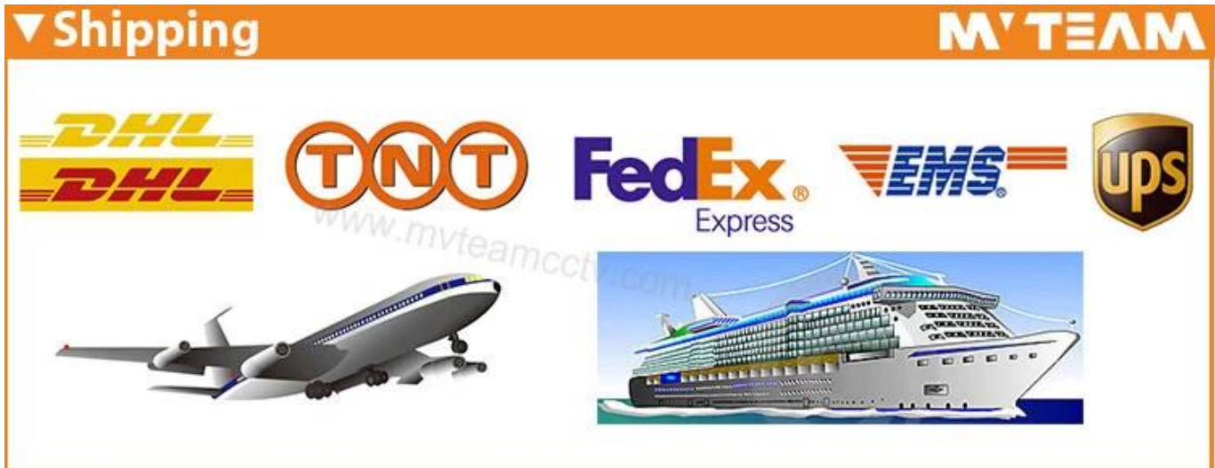
Shipping: Based on the your demands to choose the best shipping way.