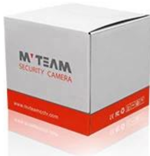
Brand Camera Package