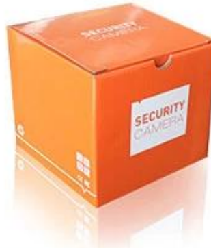
Neutral Camera Package