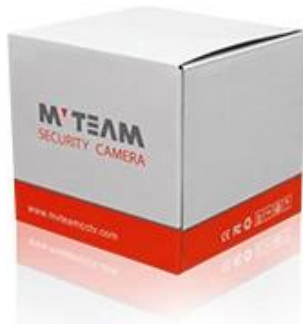
Brand Camera Package