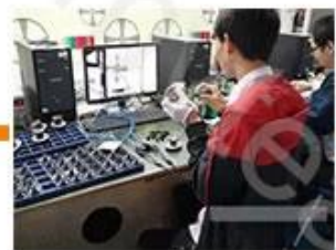
Camera Test 1