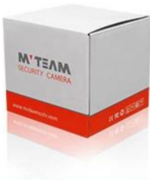
Brand Camera Package