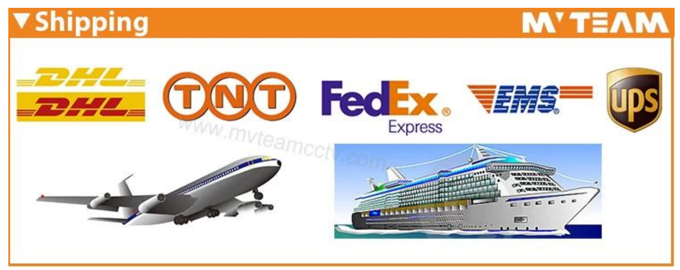
Shipping: Based on the your demands to choose the best shipping way.

Package: MVTEAM Brand Box Or Netural Box Or Specified by customer.