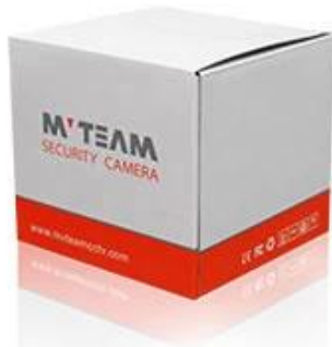
Brand Camera Package