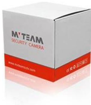
Brand Camera Package