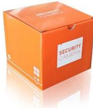
Neutral Camera Package