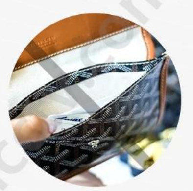
Don't need worry about can't find the key when going home