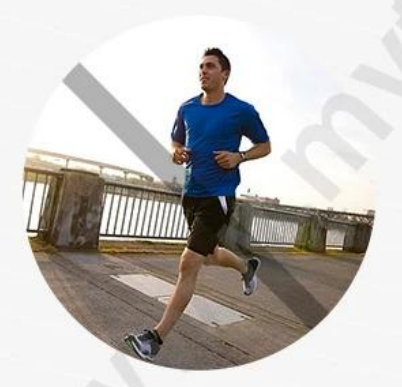
No need to bring a bunch of keys when exercising