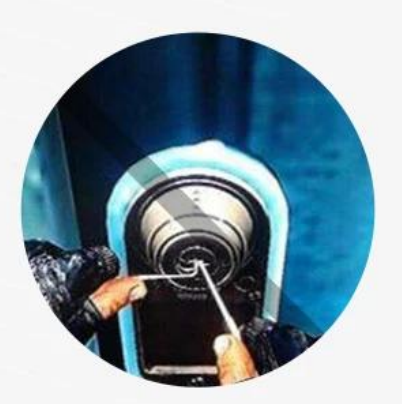
Don't need pay to unlocking company when losing the key