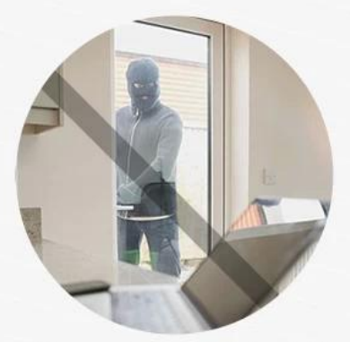
Keep your property safe when nobody at home