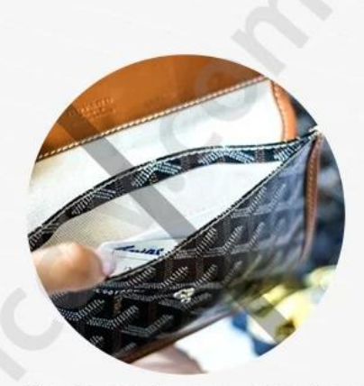
Don't need worry about can't find the key when going home

Keep your property safe when nobody at home