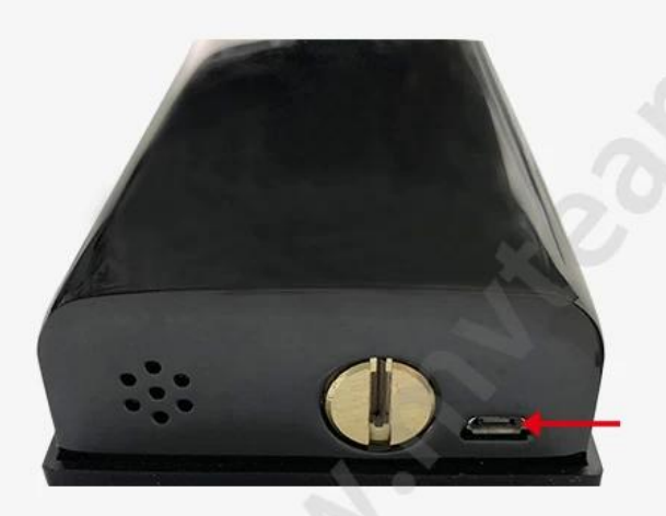
USB Charge With backup USB port for emergency charging.