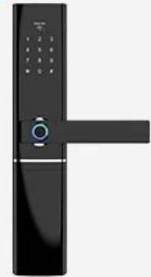
Bluetooth Door Lock

Please note the gateway device is only fit for MVTEAM smart door locks with APP, and the cost is not included in the smart lock price. If you need it, please tell us when purchasing smart door locks, we will add it into your order.