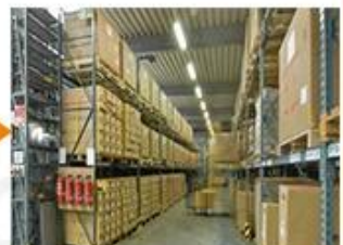
Ready for shipping